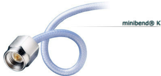
The 40 GHz version of the original minibend®